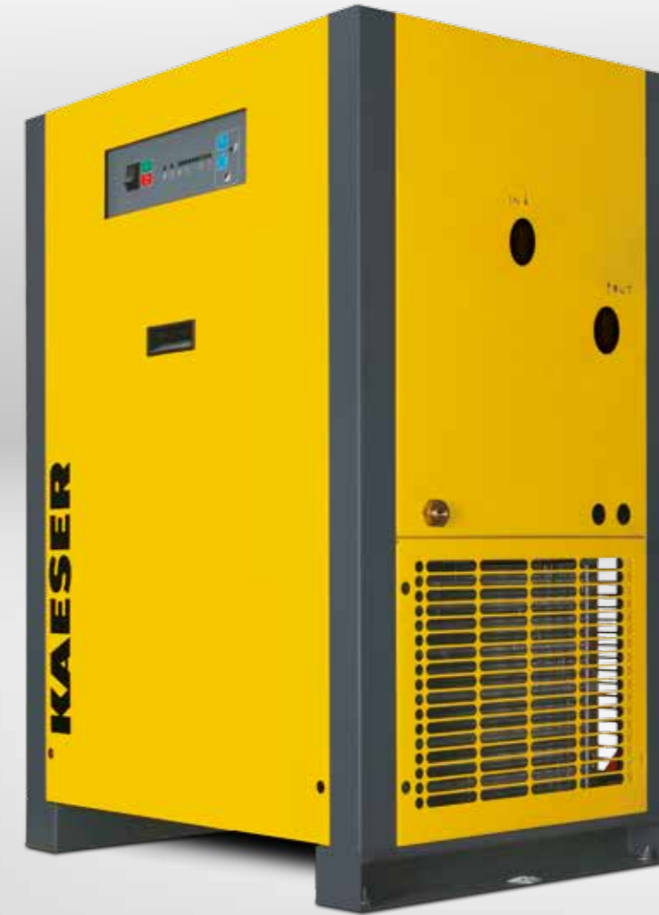
Standard version THP 40-50